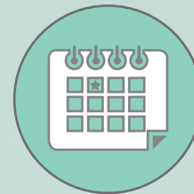
Parties & Events